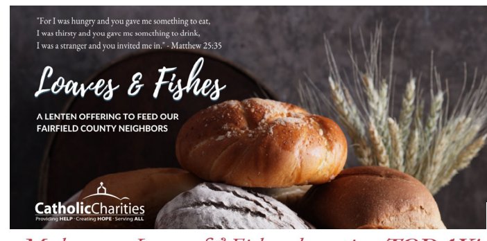
Make your Loaves & Fishes donation TODAY!

The assessment is used to cover the cost of Diocesan operations and schools. The formula is based on <u>all</u> gross receipts. For our 2023 fiscal year, the annual Cathedraticum Assessment is $81,472. This equates to a weekly payment of $1,567. This represents an annual decrease of $3,600.00 from the prior year.